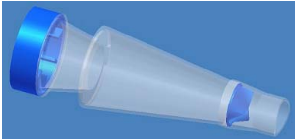
The CFDRC MDI Spacer

Increasing numbers of children and seniors require inhalation therapy for asthma, and other pulmonary diseases. Metered Dose Inhalers (MDIs) dispense aerosolized drugs that are inhaled by patients. An inhaler spacer reduces aerosol droplet size by evaporation for deep lung penetration. This also reduces the number of larger droplets that deposit in the upper airways, get swallowed, and contribute to side effects.