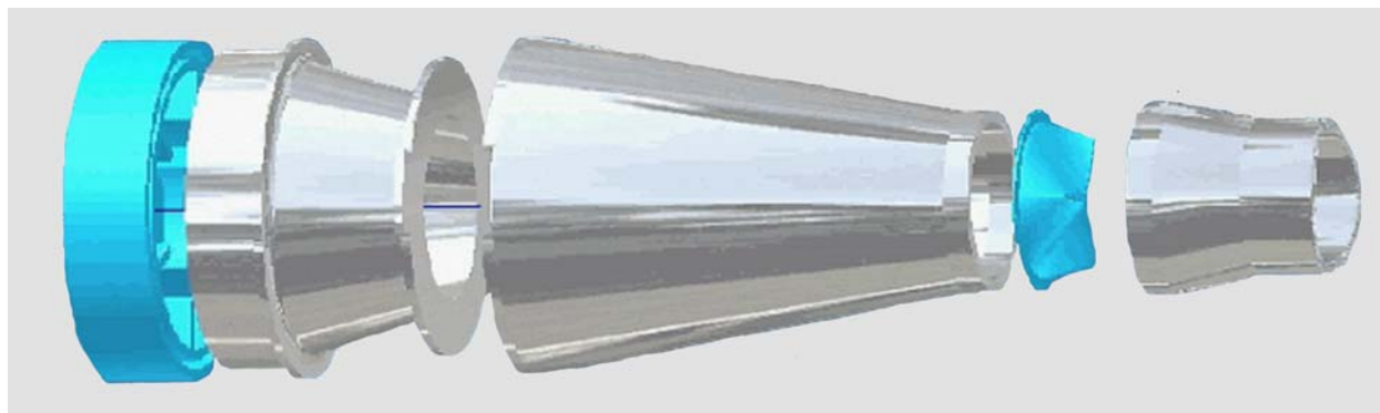
Exploded View of the CFDRC MDI Spacer

The CFDRC Metered Dose Inhaler (MDI) Spacer technology delivers a higher fraction of dispensed drug deep into the lungs and wastes less drug than other spacer technologies. An exploded view of an anodized aluminum prototype showing the component parts of the spacer is shown below. Prototypes have also been made from polycarbonate and other plastics. The mouthpiece adaptor and valve are made of Krayton and silicone plastics.